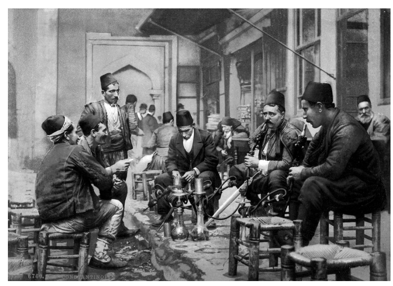
Figure 1 A historical coffee shop in Istanbul in the 18<sup>th</sup> century (http://blog.milliyet.com.tr/kahvehane-kiraathane/Blog/?BlogNo=350843)

The major characteristics of coffeehouses as public places were that they included different social groups with different educational, economic and ethnic backgrounds but were restricted to male members of society (Dallaway, 1799; Salzmann, 2000). According to Perry (1743), coffeehouses (Fig. 1) were places frequented by people who had nothing to do other than to talk and pick up news. However, they sometimes became a literary forum where poets recited their poems and entered into discussions with the public (Hattox, 1996). Another visitor, a young Polish count, expressed his admiration for the diversity of topics and the politeness and the refinement in the coffeehouses of Istanbul (Potocki, 1999). During this time, coffeehouses played a remarkable role in the facilitation of public debate, and according to Chardin (1724) the degree of freedom of speech that was allowed in the coffeehouses of the Orient was unique. in addition, they were called 'school of the wise' because of people could learn and do many things in coffee shops.