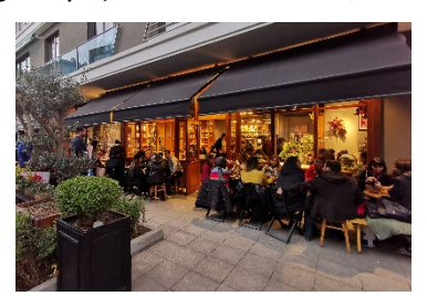
Figure 2 Coffee shops from Kadikoy, Istanbul

According to a survey conducted in 1971, there were 5082 coffeehouses in Istanbul. Beyoğlu, which had been the Western style entertainment center in the city since the 19<sup>th</sup> century (Dokmeci & Ciraci, 1999), had the highest number of coffeehouses (1133). The districts at the periphery had fewer. For example, Beykoz was found to have 139 coffeehouses (Birsel, 2001). At that time, Kadikoy was ranked fourth in the list of coffeehouses, but nowadays it has the most. This is because it has become the most preferred district for higher income people due to the multi-center urban development that arose from the construction of the bridges over the Bosphorus and the construction of the peripheral highways (Dokmeci & Berkoz, 1994, 2000) (Fig. 2).