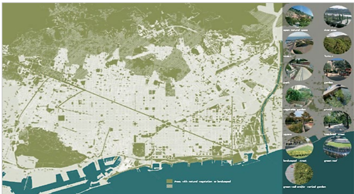
Figure 5 Green Infrastructure Network of Barcelona (Basnou et al., 2020)

3. Barcelona City, Spain: Barcelona's "superblocks" concept is a city-wide initiative rather than a specific project with a single designer. The Barcelona City Council and the Institute for Urban Landscape and Quality of Life (IUQB) developed and implemented the concept in collaboration with various urban planning and transportation experts. (Shan et al., 2021; Basnou et al., 2020). The specific implementation of superblocks involves the reorganization of nine-block clusters, limiting vehicle traffic within these areas, and transforming the reclaimed space into pedestrian-friendly zones, green areas, playgrounds, and social gathering spaces. The goal is to prioritize pedestrians, promote sustainable modes of transportation, and improve the overall quality of urban life (Basnou et al., 2020). Garden irrigators also use sensors to track rainfall and humidity levels and adjust the amount of water used in each area.