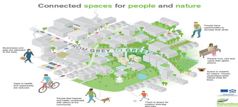
Figure 1 Green space design as part of the city's urban management