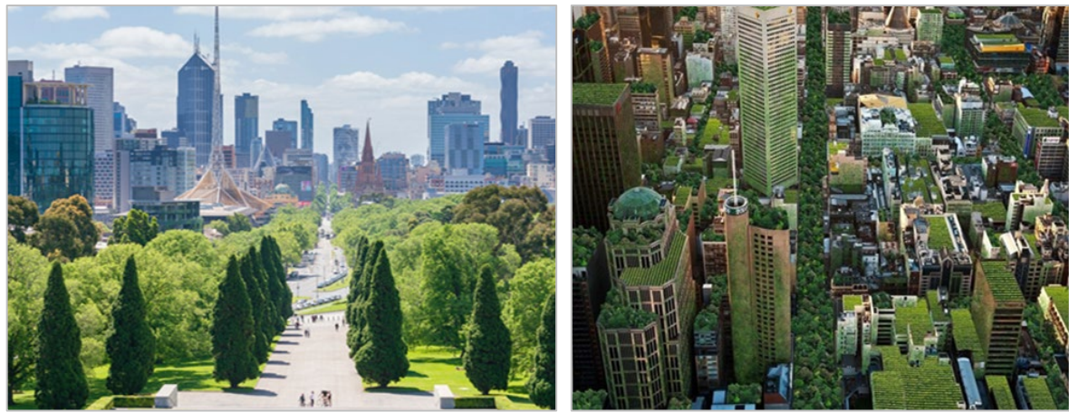
Figure 6 Roofs and green spaces in Melbourne

4. Melbourne, Australia: The Melbourne Urban Forest Strategy is an overarching approach. It is a comprehensive strategy developed by the City of Melbourne, Australia, collaborating with various stakeholders, including urban planners, landscape architects, environmental experts, and community members. The strategy aims to increase tree canopy cover in the city, with a 40% tree canopy cover target by 2040. It encompasses a range of initiatives, including tree planting programs, community engagement activities, and the use of technology for monitoring and managing the urban forest (Mortaheb & Jankowski, 2023; Basnou et al., 2020; Alfriani et al., 2022) application of intelligent irrigation and design programs to improve water and soil quality in green spaces.