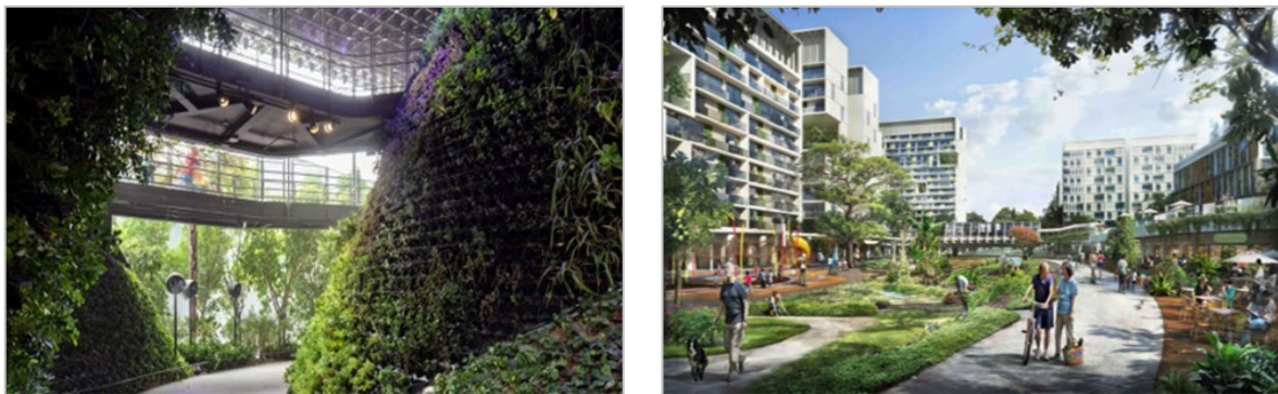
Figure 3 Smart Urban Green Space Management in Singapore

2. Copenhagen, Denmark: Copenhagen, Denmark, manages and develops the city's green spaces using smart urban technologies. To improve the city's air and water quality and provide favorable environments for wildlife, these efforts include creating new parks and green areas and improving the design of existing green spaces (Chang & Das, 2020; Greopanta, 2020). Waste-to-Energy Plant Copenhagen is home to the famous Amager Bakke waste-to-energy plant, also known as Copenhill. While primarily serving as a waste management facility, it features a unique design incorporating a ski slope on its roof, allowing visitors to engage in recreational activities such as skiing and snowboarding. The Danish architecture firm Bjarke Ingels Group (BIG) designed the plant, and it has become an iconic symbol of sustainable urban development. Rooftop Gardens Copenhagen has