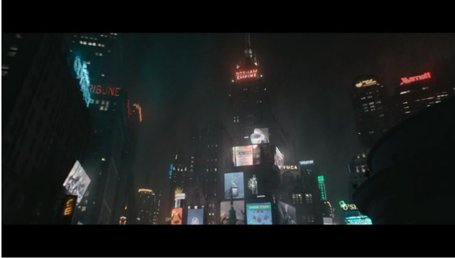
Figure 1 Gotham City

The power is possessed by the king, towards the people. Today, the power dynamics are applied from top to the bottom, but by a cruel big brother-like dictator who uses his power against passive people. But the power is not a monopolized, own name, it's a reciprocal active verb. Foucault takes the theory further away from monopolization and expresses power dynamics as complicated notions spread everywhere and intertwined together with the depths of society. But that doesn't mean that the relationships are equal. The ones who hold the highest fund are in power, and this gives them the delusion of only they can apply power.