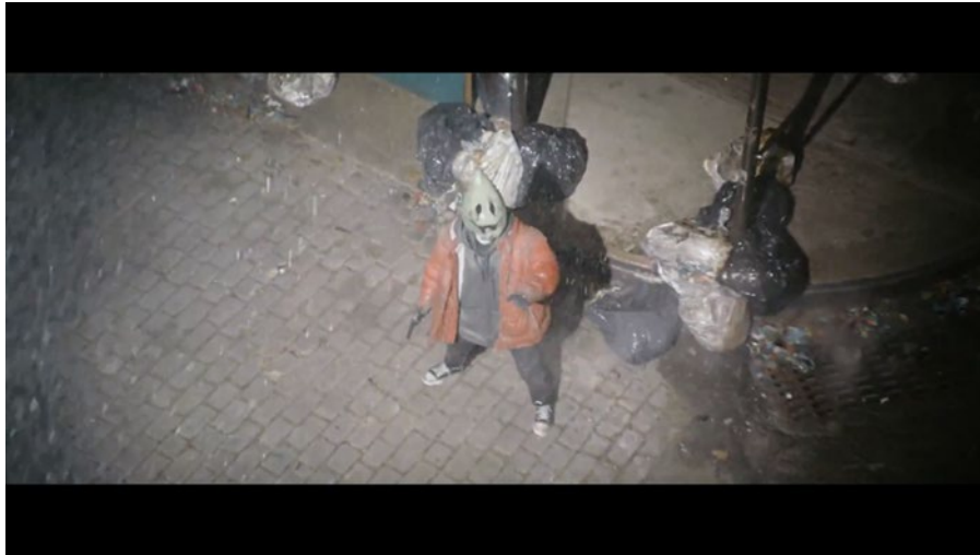
Figure 2 Thieves see the Batman sign

After the police helicopter flew and showed the Batman signal in the sky, Batman describes his symbol: "But when this light reflects on the sky, it's not just a calling, it's a warning! For them. Fear is a tool. They think I'm hiding in the shadows, but I am the shadow". The bat signal is the guardian tower of the panopticon. Therefore, the panopticon is an intangible method of perfect power dynamics that isolated, systemized, and supervised individuals, and created an internalized thought pattern for making people docile and "normal". In the panopticon, the bodies are not the "things" that should be punished, oppositely they are the "things" that should be controlled and made more productive by the government and employer. In this process, the hidden state of the observer is very important for maintaining control. The basic factor that builds the power is the seer, the observer is not being seen. It already built its power by this hidden state. People inside the panopticon "...are masses, but not a community from the viewpoint of the observer. But from their viewpoint, they are lonely and isolated individuals" (Bentham & vd., 2012 p. 16). Their isolation makes them lonely and helpless. But at the same time, they can't be alone due to being exposed to the other's observation. In time, the gaze itself should be internalized by individuals. No matter if people prefer this or not, the power of the gaze, creates change for them.