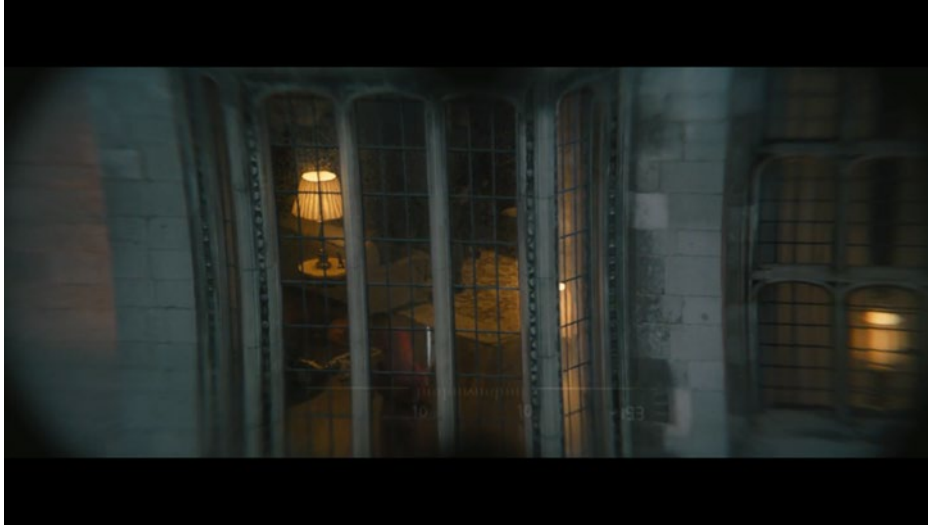
Figure 3 Riddler watching the Presidential candidate's house