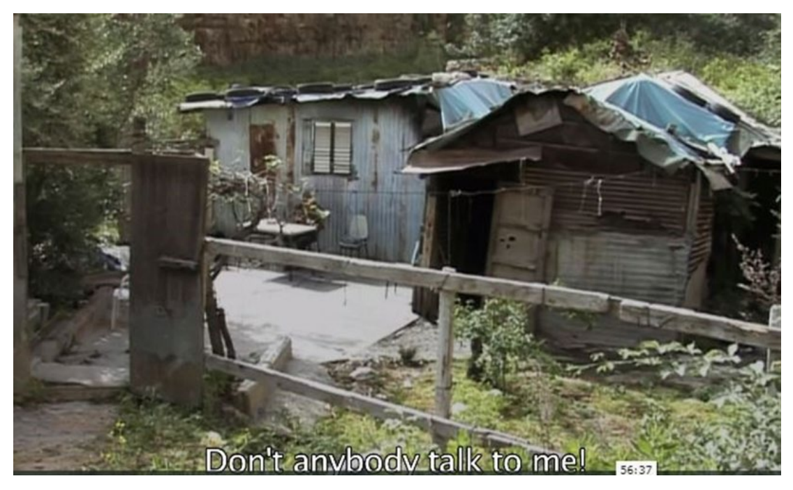
Figure 8 shack of Yousuf and Amna. Source: 'Roshmia', Salim Abi-Jabel, 2015