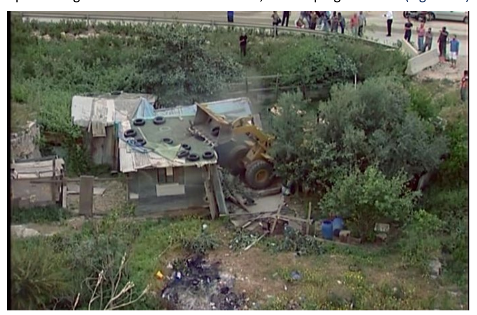
Figure 12 shack of Yousuf and Amna, right before demolition, Source: 'Roshmia', Salim Abi-Jabel, 2015

Wadi is not worth living, Amna who is tired of the struggle and is ready to leave and move to an apartment, representing another Palestinian narrative, a more pragmatic one (Figure 13).