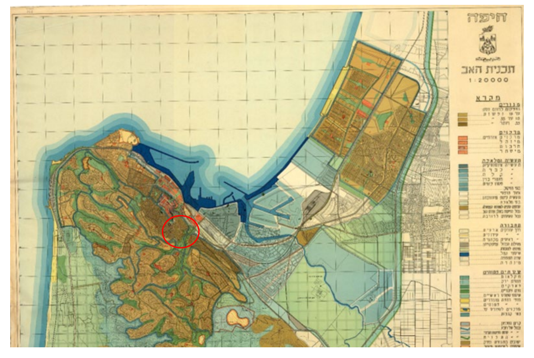
Figure 6 TPF 1954, Master Plan for Haifa by the Office for Master Plan of Haifa, Source: the Haifa City Archive

However, the 1954 master plan was cast aside. The Rushmia Wadi did not become a central park but a backyard. Since the late 1960s Israeli authorities made efforts to destroy the houses and depopulate the Wadi (Schori et al. 1968). The city was developing as far away as possible from its past: the downtown was left in its ruins,<sup>6</sup> the Arab neighbourhoods around it were severely neglected, gradually deteriorated to poverty and crime, with many houses destroyed. It had become an 'area of trauma', that could not be planned by conventional means (Schwake 2018).