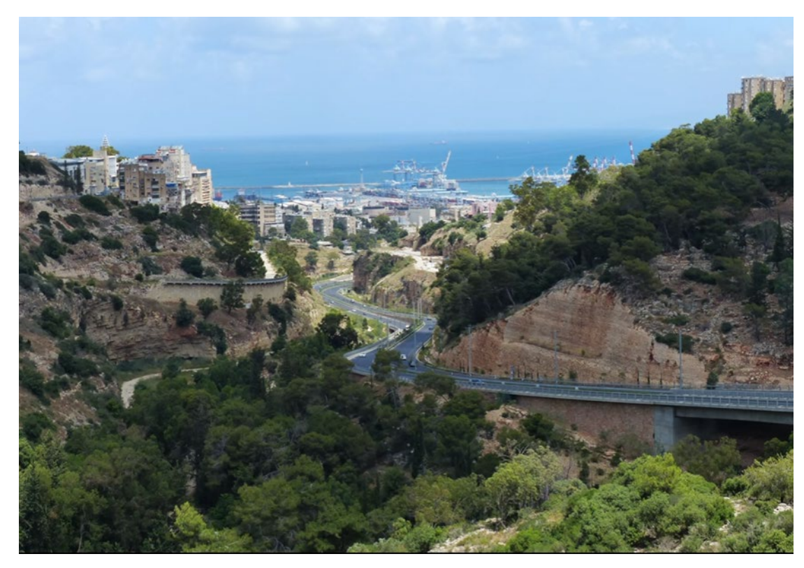
Figure 1 Wadi Rushmia, photograph by the author, 2017

The Wadi community survived for over a century. Its nucleus was established by migrant workers from Gaza, in the beginning of the 20th century, during Ottoman rule and the construction of the Hejaz railway (1904). Due to the housing shortage in the old city of Haifa the workers established a neighbourhood of tents and shacks (Mansour, 2017). Throughout the years the Wadi's population had grown and often changed. At its peak in the 1930s it reached three thousand. Its residents had escaped early in the 1947-48 battles and the houses remained empty until the 1950s.