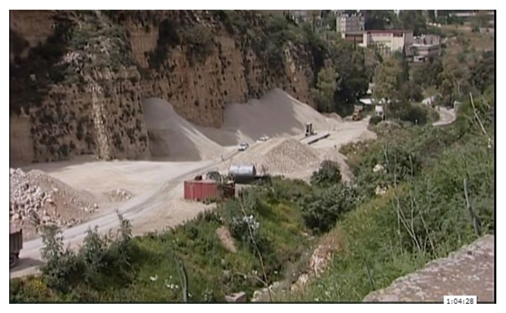
Figure 7 works in the Wadi, 2014, Source: 'Roshmia', Saleem Abu-Jabel, 2015

Rushmia and the old city and surrounding neighbourhoods were Haifa's 'areas of urban trauma', areas with which conventional positivist planning strategies could not contend. As noted by Schwake, when an urban area is subjected to a trauma, its everyday life is disturbed and unable to regenerate, causing it to perform as an exterritorial urban void (2018: 51). In Haifa, urban trauma was created as Israeli planners aimed to destroy and rebuild Arab neighbourhoods, not tending to the trauma that cast its shadow on the urban space and its people, and therefore succeeded only in intensifying its symptoms. As Schwake notes, when an area is redeveloped with a clear intent to obliterate its past, the urban system will be unable to recover from its past, and the trauma will continue to dictate its everyday life (ibid). Urban trauma could be worked through only by acknowledging the past, then trauma could be reconciled by spatial transformations and the improvement of conditions (Hatuka 2010). This paper will suggest that film, which visualizes spaces of trauma, make their stories audible, and become their archive, may be a means of acknowledging and coming to terms with the past, taking part in processes of finding just and sustainable solutions to areas of trauma.